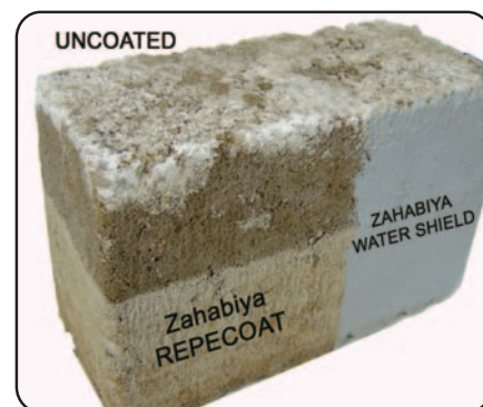
Zahabiya REPECOAT coated on the lower half of a brick. Effectiveness against damp rise can be seen.

* Since the stones are of variety of type and porosity, actual consumption cannot be predicted.